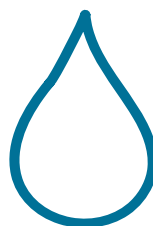
Generation of too much water

The following are the major factors that contribute to condensation: