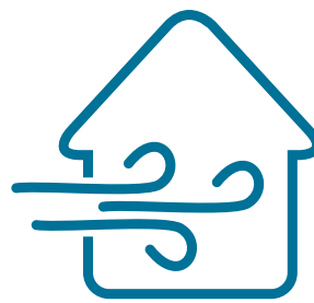
Lack of ventilation