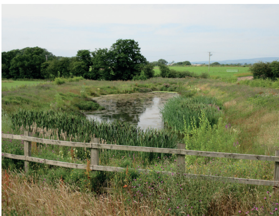
Figure 6.2 Pond

Retention basins and ponds have a permanent pool of water. The permanent pool of water is replaced in part, or in total, by stormwater during a storm event. The hydraulic residence time for the permanent pool over time can provide biochemical treatment. These devices allow sedimentation of solid particles to occur and can be effective at reducing nitrate levels and at capturing particulate organic nitrogen in the summer. If good plant growth can be established in and around the margins of the pond, this will facilitate the uptake of nitrogen, and a proportion of the plants should be harvested at the end of the growing season.