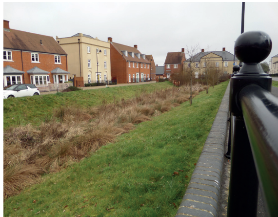
Figure 6.3 Bioswale

Wetland channels and bioswales are designed to convey flow very slowly so that infiltration into the soil surface takes place, and the plants will assimilate the nutrients. A wetland channel or bioswale is designed to support dense wetland vegetation on its bottom and this should be harvested at the end of the growing season. Aerobic micro-biological activity in the soil layers can break the ammonia down into nitrates, and plants will use the nitrates for growth. However, nitrates are soluble and can be washed down through the soil horizons and risk polluting underlying groundwater. So, wetland channels and bioswales in nitrogen sensitive catchments must be lined and surplus flows conveyed downstream, unless the runoff has been pre-treated in a pond or basin (Section 6.2) and the risk is low.