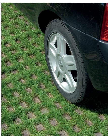
Figure 6.6 Driveable garden

Concrete block permeable pavements do not reliably remove nitrogen from stormwater, so if they are deployed in a SuDS management train to manage nitrogen pollution on residential developments, they should be used for small areas, with a low risk of pollution, where other devices cannot be deployed. Alternatively, grassed permeable surfaces provide better treatment and, where possible, should be considered instead of block pavers. For driveways, alternative solutions such as a combined gravel rain garden or a driveable garden may be better. Whichever permeable surface is selected, the subsurface drainage from beneath the permeable pavement should be captured and directed onward to a secondary treatment device. It cannot infiltrate to ground in nitrogen sensitive areas as it is likely to contain residual levels of nitrates.