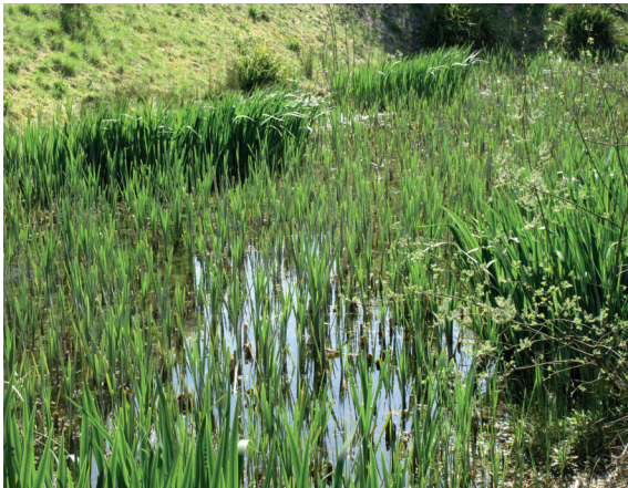
Figure 6.1 Treatment wetland

Wetlands and floating wetlands can be very effective at capturing and removing nitrogen from stormwater as they contain variable depth zones, some of which create anaerobic conditions for denitrification, and they support extensive plant growth. The long residence times allow microbial transformation of nitrogen to occur. Wetlands will not be considered in this guide as they are described in detail in the framework approach by McInnes et al (2022).