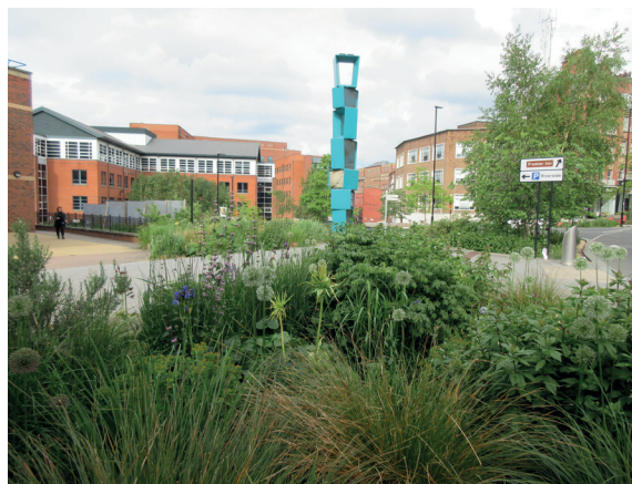
Figure 6.4 Raingarden

Bioretention zones, tree pits, and rain gardens are landscaping features adapted to provide on-site treatment of stormwater runoff. They are commonly located in car parks, along residential streets or within small pockets of residential land. Surface runoff is directed into shallow, landscaped areas with engineered soils, with or without underdrain systems. The filtered runoff can be collected in a perforated underdrain and returned to the storm drain system to be conveyed forward. If it has been pre-treated in a pond or basin before it enters this device, it may be possible to allow the effluent to infiltrate to ground. These devices capture particulate organic nitrogen from leaves and other organic debris at the surface. There will also be effective breakdown of ammonia in the aerobic soil horizons and the plants will take up some of the nitrates as they grow. Sometimes designers will incorporate a continuously submerged anoxic zone to promote denitrification in the device. However, the provision of these zones in UK summer would be unreliable and should not be included unless it is agreed with Natural England that artificial dosing systems and monitoring equipment can ensure the anoxic zone exists all year round.