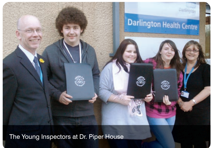
The Young Inspectors at Dr. Piper House