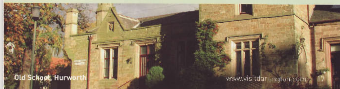
Old School, Hurworth