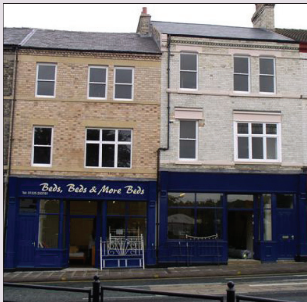
After grant-aided restoration, with new slate roof, timber sash windows, chimney pots and traditional shop fronts

For further advice about the Article 4(2) Direction affecting the Northgate Conservation Area, call the Planning Services section on 01325 388799 or the Conservation Officer on 01325 388604 or email: planning.projects@darlington.gov.uk