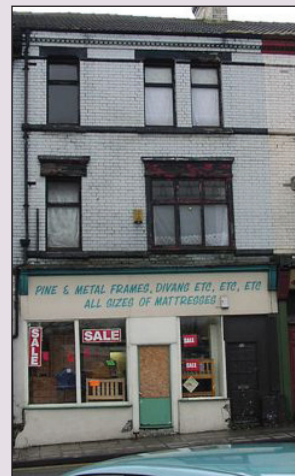
Properties on Northgate prior to restoration