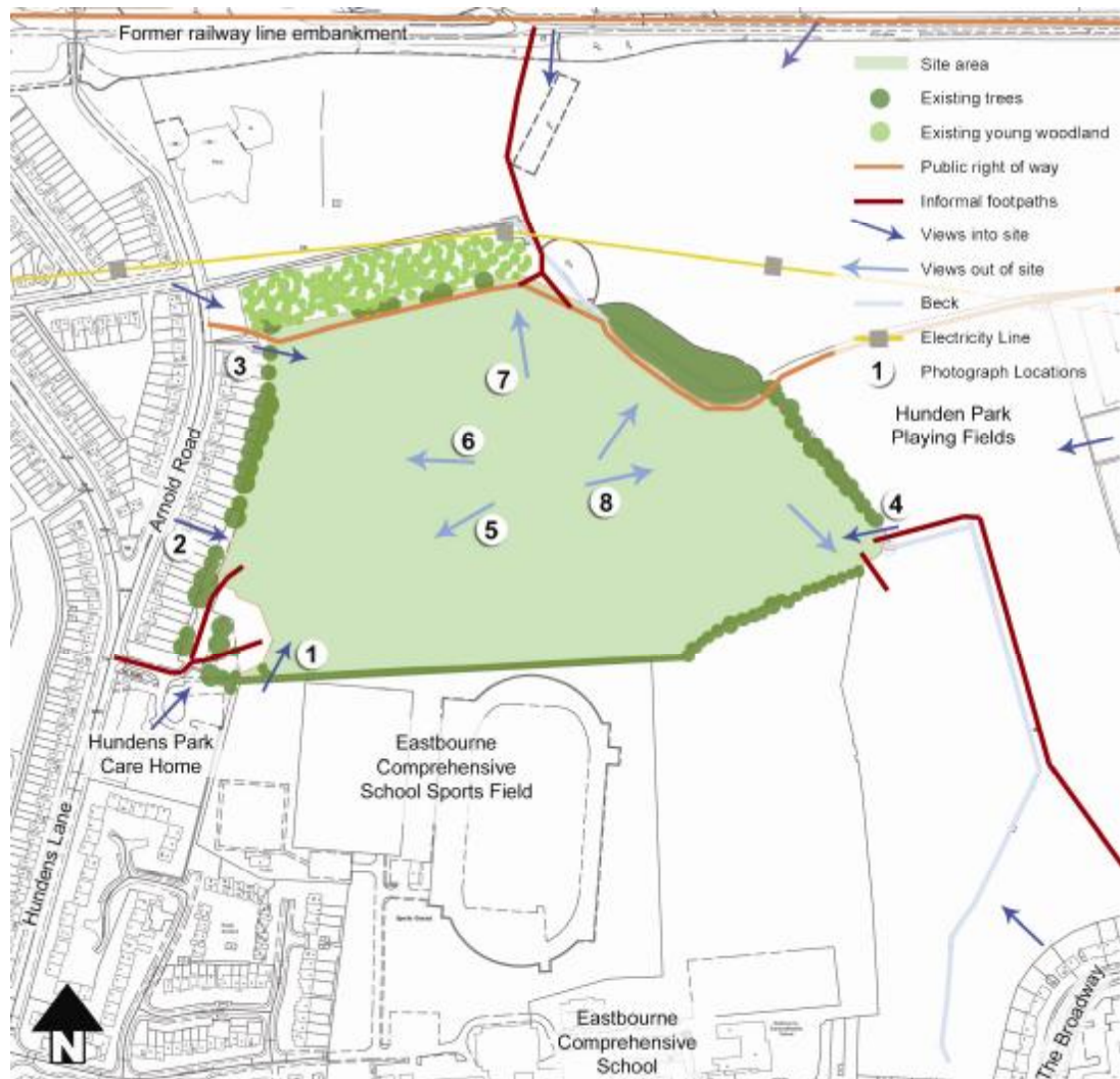
Figure 1 – Landscape features of the existing site

The site is located on the edge of the Darlington urban area. It is a large open site, predominantly level with a defined boundary. Mature trees along the west and north boundary provide a clear boundary marker. To the south and east a small hedge defines the space, incorporating a palisade fence along the school boundary.