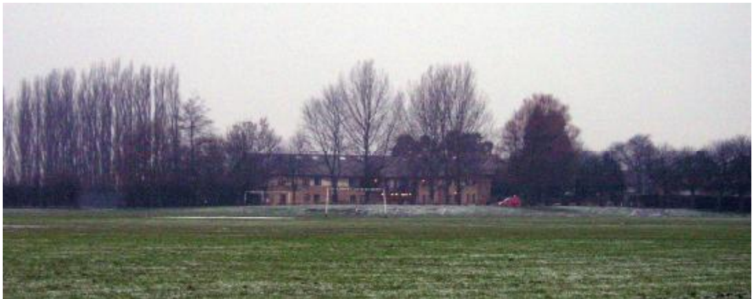
Photograph 6 – View of housing along Arnold Road