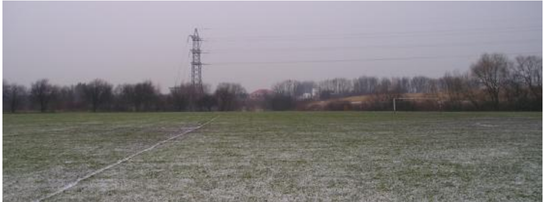
Photograph 8 – View of industrial and commercial developments east of the site