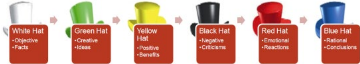
De Bono's Thinking Hats