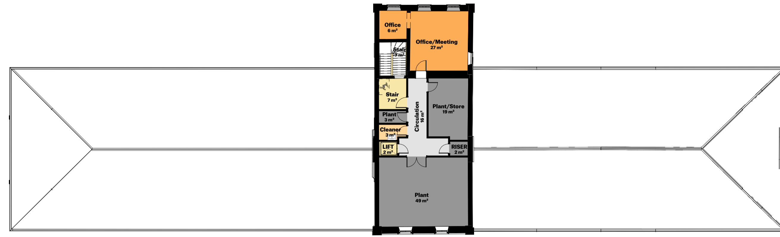
Level 02 GA - Proposed 1:200