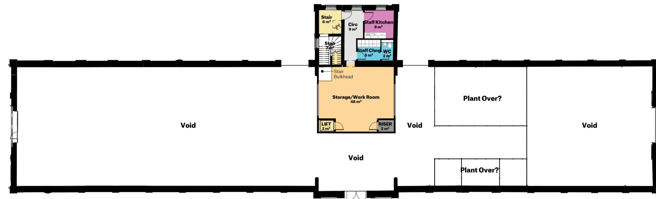
Level 01 GA - Proposed 1:200