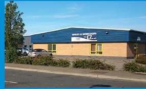
Flexspace Lingfield Way, Darlington, DL1 4QZ