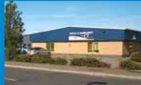
Flexspace Lingfield Way, Darlington, DL1 4QZ