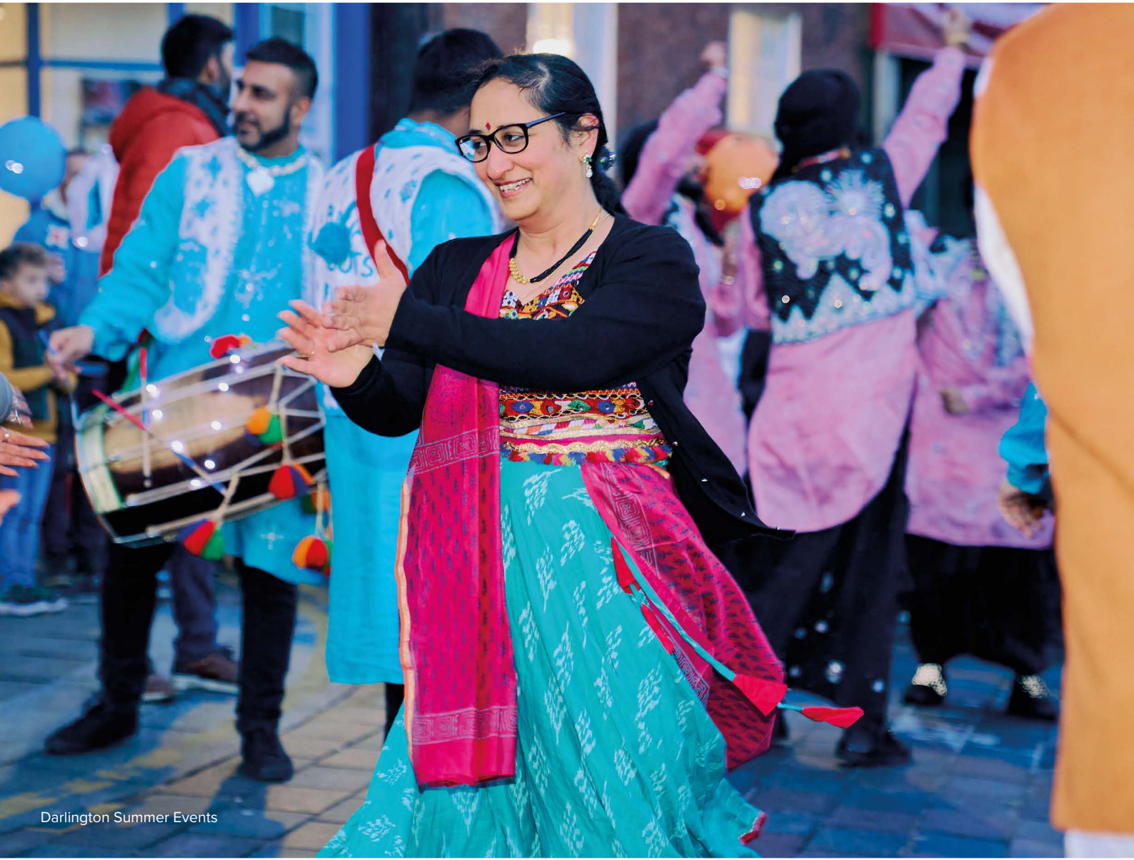
Darlington Summer Events