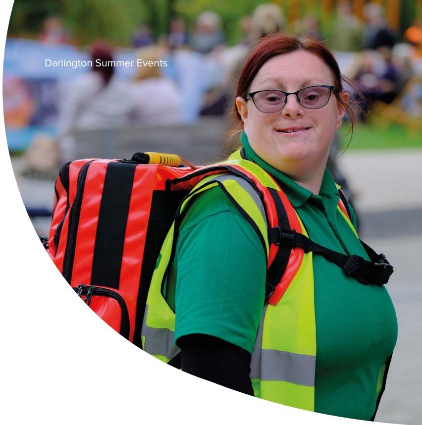
Darlington Summer Events