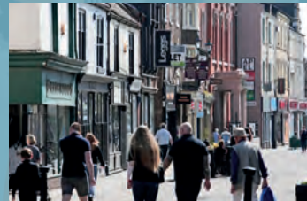
Skinnergate and the Yards