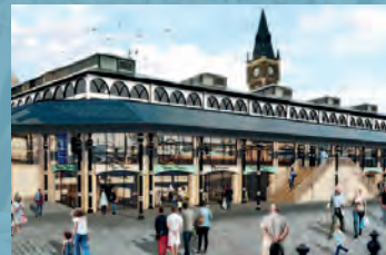
Victorian Indoor Market